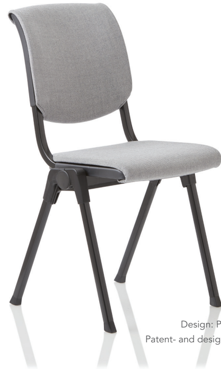
Design: Peter Opsvik Patent- and design protected